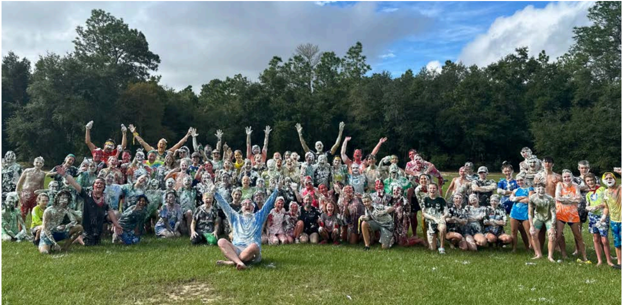
Middle School Ministry after the annual "Messy Games" competition at the Hang10 October Weekend.